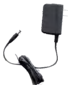
Switching Power Adapter