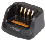
General MCU Rapid-rate Charger (for Li-Ion/Ni-MH batteries) CH10A07