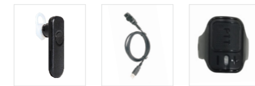
Wireless Earphone Programming Cable (USB Port) Wireless Finger PTT